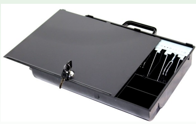
Ball Bearing Technology